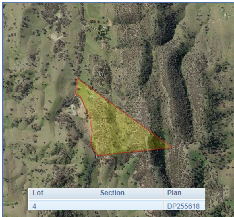
Map 2 Excerpt from Lot Size Map Sheet LSZ_006